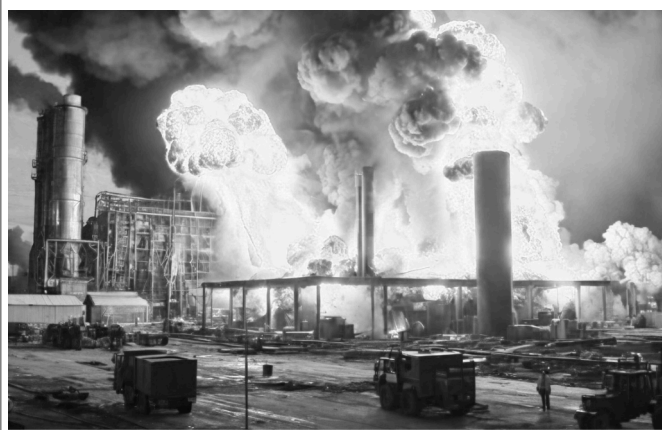
Dragon firefighting crews arrive at the site, ready to battle with the cock-shaped clouds.

Chaos reigned and rained yesterday after an explosion at the local aphrodisiac factory brings aerosolized love to the community. Although officials are being mum on the actual causes, the initial suspicion is that a leap within the primary pressurised brewing tank convinced a substantial portion of the factory staff to become hyper aroused and nymphomaniacal, leading to an orgy that likes of which can only be approached through the distance of clinical abstraction.