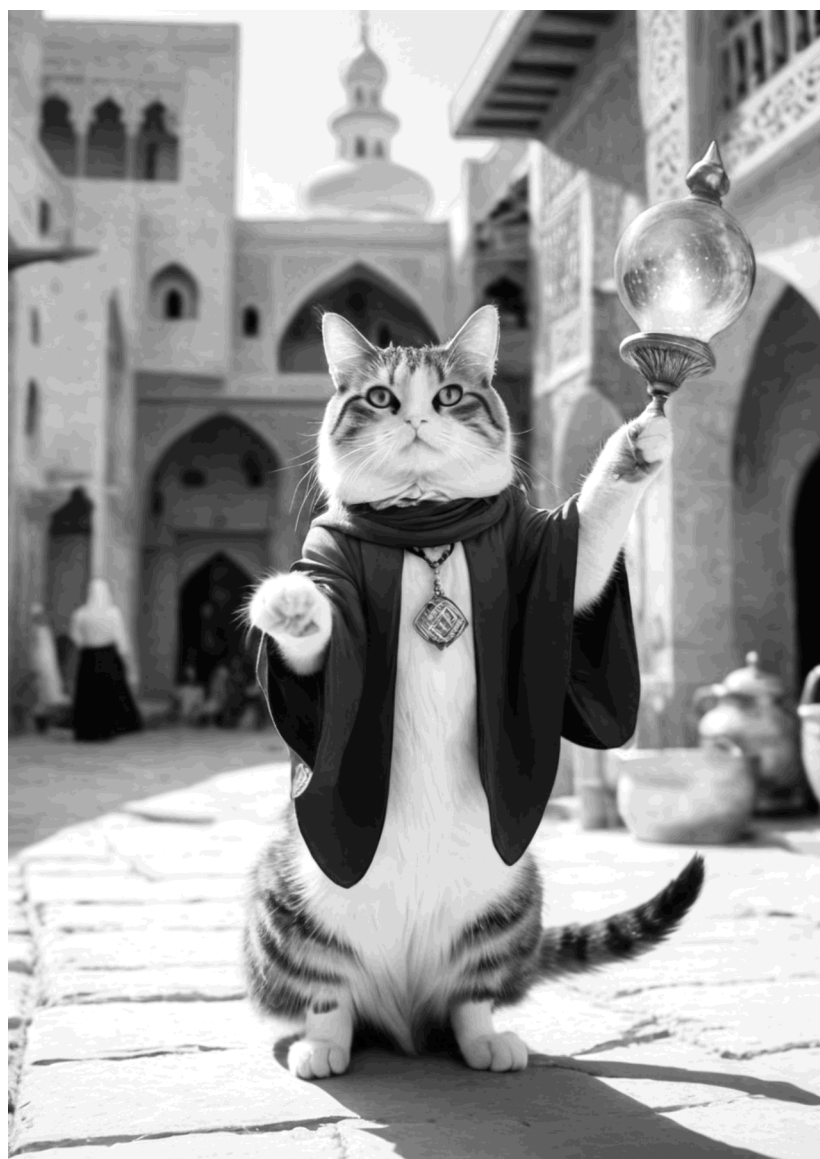
The magic lantern sales are on the rise as locals and tourists switch to them as means of communication.